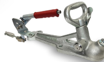
3.5T Fixed with park (suits electric brake)

The new range of premium AL-KO lockable couplings are designed to ensure your caravan or trailer is secure, and eliminates the need to purchase and fit a separate coupling lock.