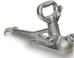
614015L 3.5T Fixed