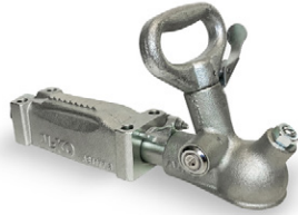
614054LPL 2T Over ride