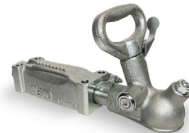
2T Over ride