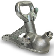
614065LPL 2T Fixed