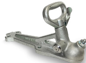
3.5T Fixed (suits electric brake)