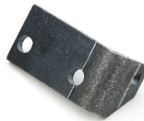
658006 Bottom bracket (Single) left hand (suit 60mm springs)