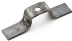
658001 Top bracket (single)