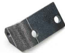
658007 Bottom bracket (single) right hand (suit 60mm springs)