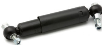
658003 Shock absorber, single for beam axles (Black) Note: Number stamped on shock absorber is 283722 refer to part number 658003.