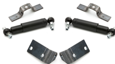
658005 Shock absorber kit. Suits single beam axle set (Suit 60mm springs)