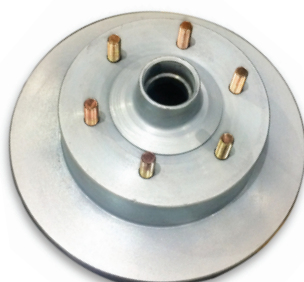
DESCRIPTION: Disc Hub 16" , Zinc Plated