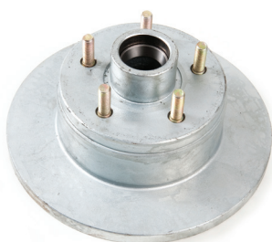
DESCRIPTION: Disc Hub 13" & 14", Galvanised

Note: the braking capacity should be matched to the planned maximum trailer mass.