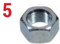
5 390021 Nut hex 7/16 UNF zinc plated