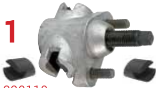
1 320110 9" Mechanical lever adjuster