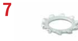
7 190054 Washer 7/16" external shake proof