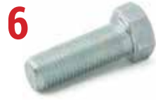
6 390020 Bolt 7/16" x 1" UNF HT