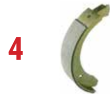
4 320150 9" Mechanical lever brake shoe (one shoe)